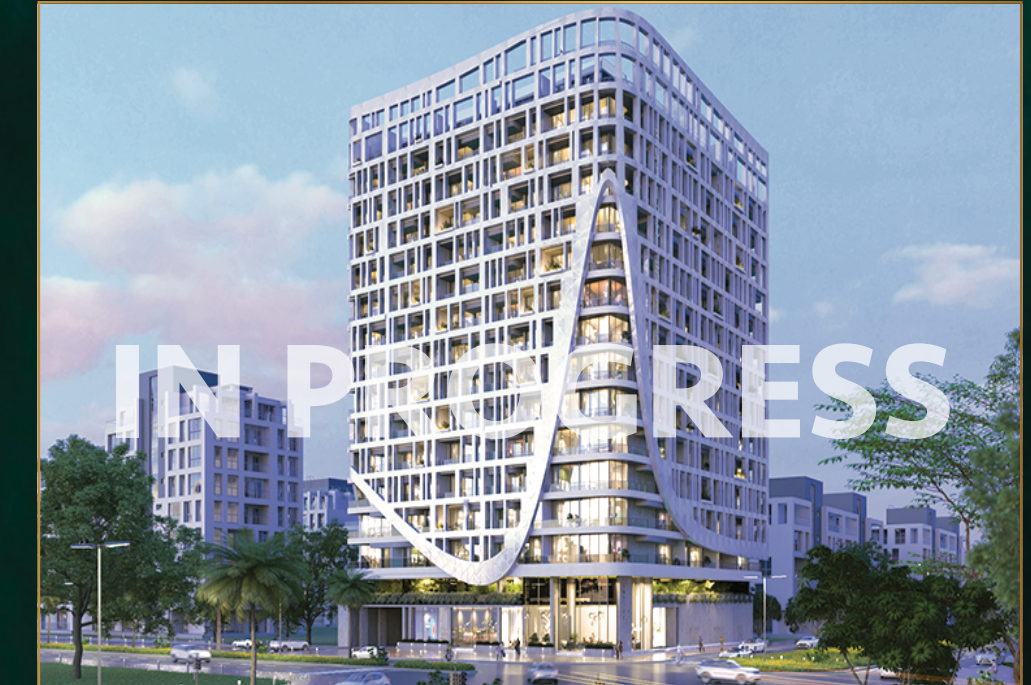
EMPIRE SUITES IN JVC