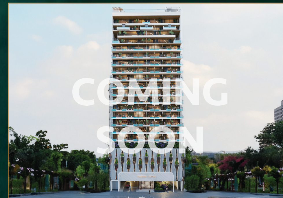
SKY LIVING IN JVC