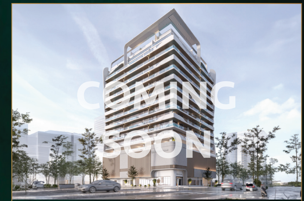
SKY VILLAS IN JVC