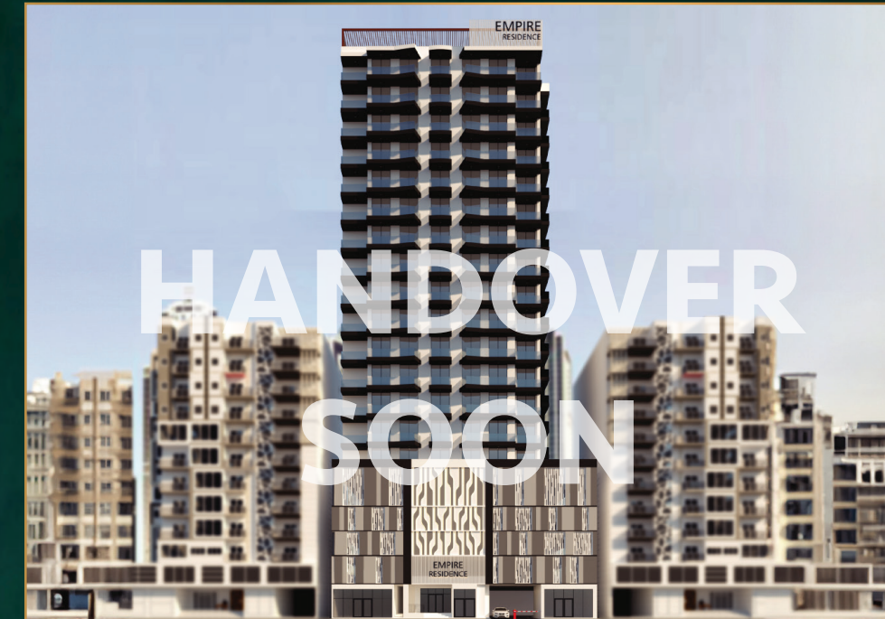
EMPIRE RESIDENCE IN JVC

Aim for a harmonious blend of functionality and aesthetics. Prioritize natural light and ventilation. Explore innovative and adaptive design solutions.