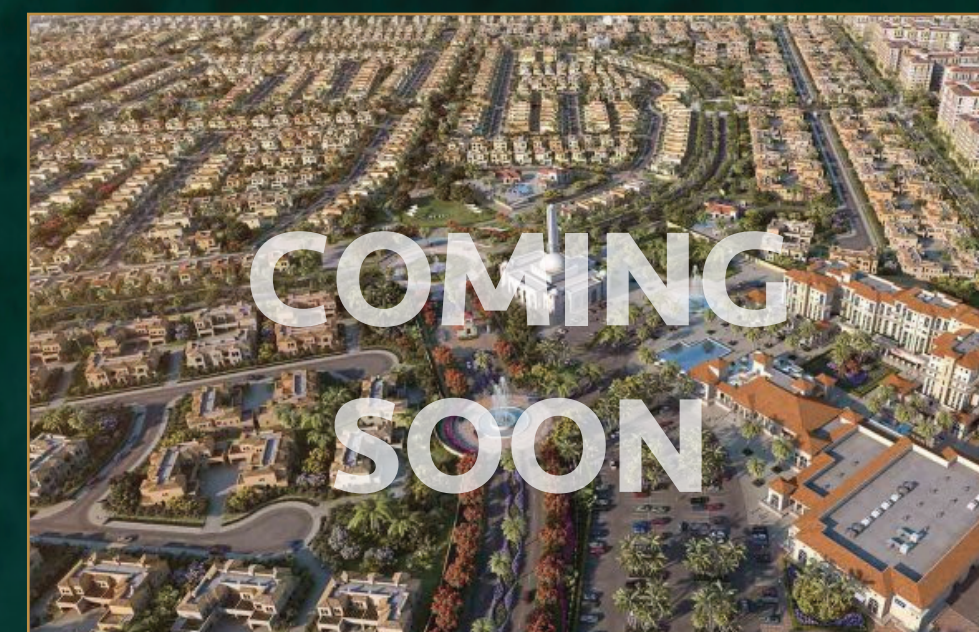
DUBAILAND RESIDENCE COMPLEX